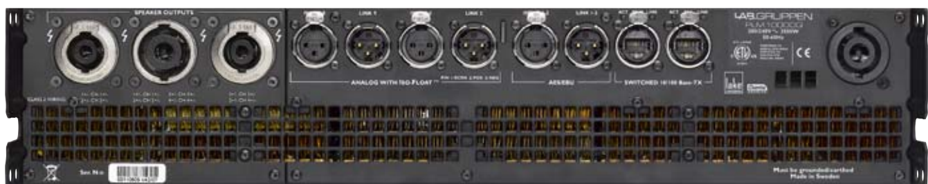
PLM 10000Q Neutrik Speakon connector version shown.

The PLM Series Powered Loudspeaker Management systems are equipped as standard with Dante, a self-configuring digital audio networking solution from Audinate® of Australia. Based on the newest developments in networking technology, Dante provides reliable, sample-accurate audio distribution over Ethernet with extremely low latency. Dante incorporates Zen™, an automatic device discovery and system configuration protocol which enables PLM Series products and other products with Dante (like Dolby Lake Processors) to find each other on the network and configure themselves.